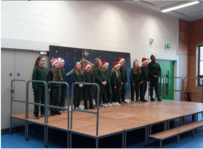
Ceolchoirm rang 6

www.gaelscoilbhailemunna.ie riomhphost: eolas@gaelscoilbhailemunna.ie